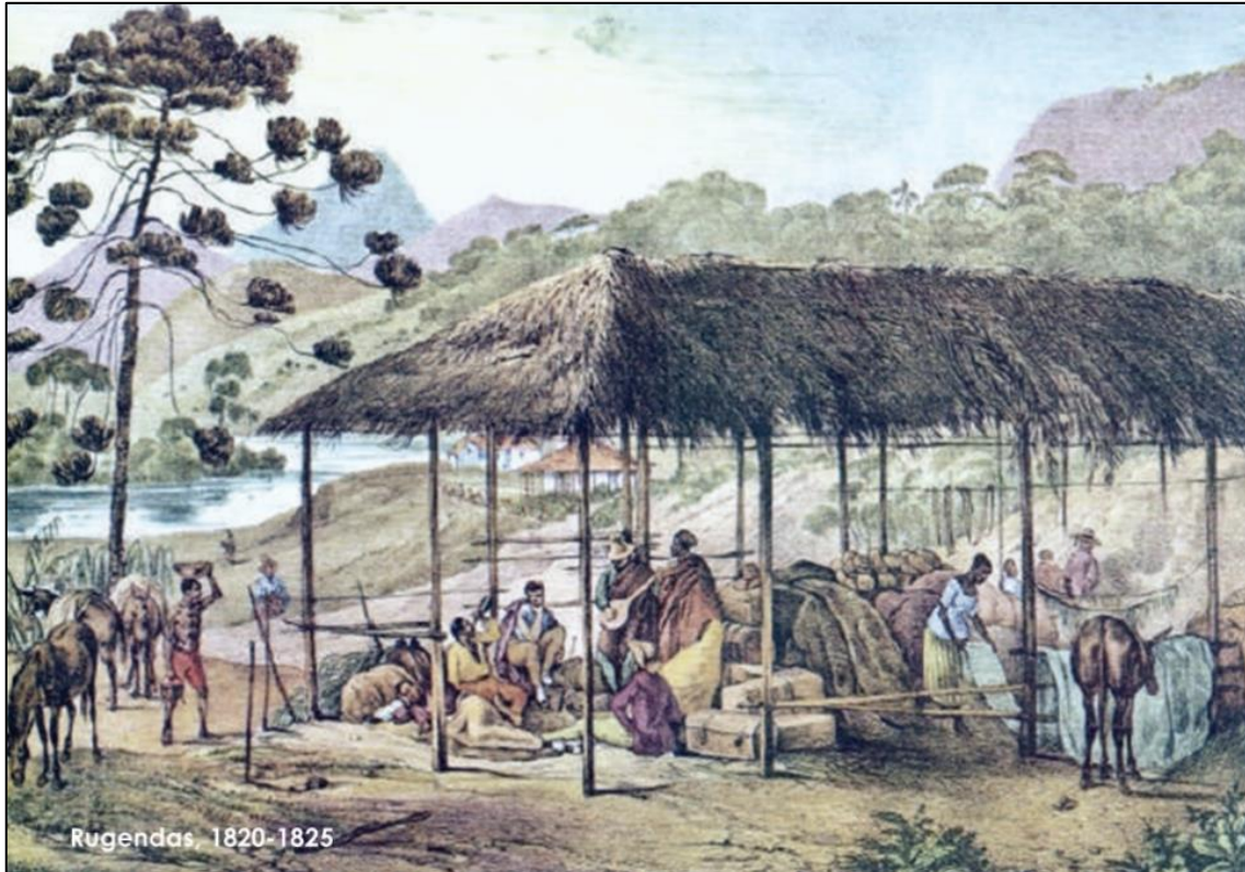
Source: Rugendas, circa 1820-1825.

A landscape agency that, despite being connected to the plantation system needs, acts differently, also promoting its characteristic marks in the landscape. Many trails used by drovers with their mules disappeared overgrown by the woods when they were abandoned, but others resisted and were re-signified and now have various uses, such as the Gold Trail, in Serra da Bocaina, with nearly forty kilometers of stone footpath (Figure 7) made in the XIX century and today used for ecotourism 51 .