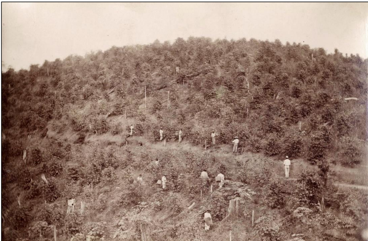
Figure 3. The coffee harvest. Paraíba do Sul River Valle.

(periodically flooded) ones such as riverbanks were excluded as a possibility to accommodate the Coffea arabica individuals, which fully developed between these two relief parts: the middle slopes (Figure 3). It is interesting to note that there was a partitioning of the land according to the best use of each cultivar, an edaphic association based on the colonizers' knowledge. Analyzing his writings, it is evident how the coffee ended up having a specific location on the land, always producing better in the hillside areas, where, according to the author, figured the clay lands.