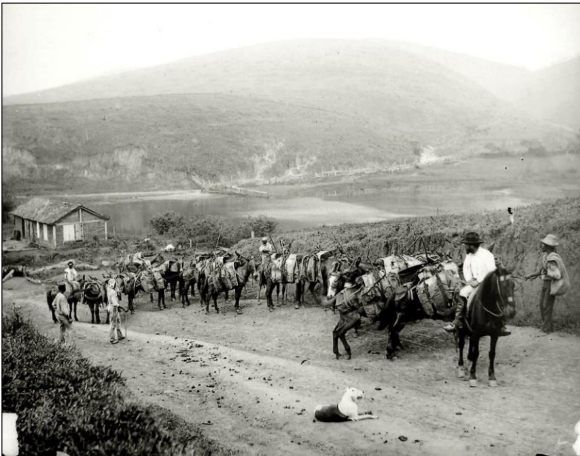
Figure 5. Drovers moving ("Tropa em movimento"). Vale do Paraíba do Sul.

men who had rusticity as a way of life, as did the "bandeirantes" who had entered the territory years before. Its mercantile forays into the territory helped to sediment old routes as well as create new ones, expanding the Brazilian territory occupation. Numerous overnight stops - the so called "ranchos" (Figure 6) - and trade points that were established along the mercantile routes gradually grew into small villages and later onto cities.