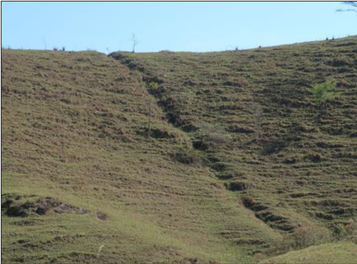
Figure 4. Ways to contain or dominate cattle in the XIX century.