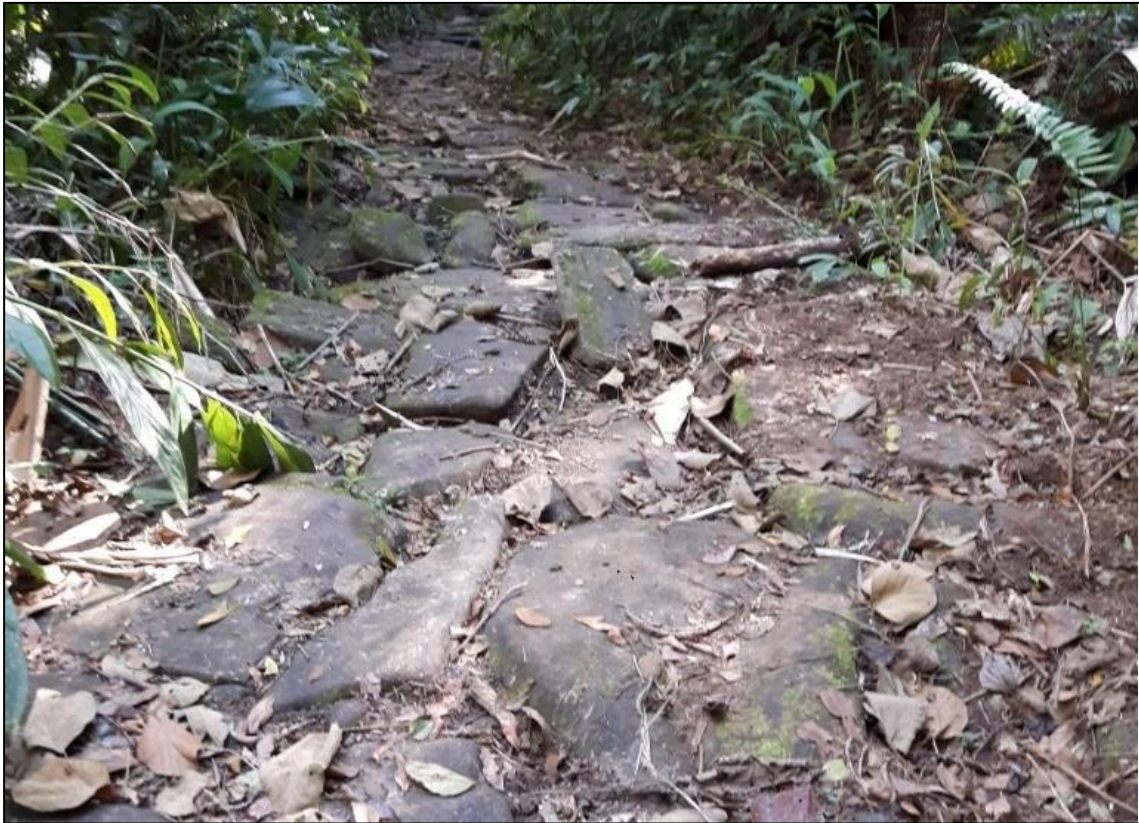
Figure 7. - Bicentenary stone footpath section that crosses the Serra do Mar slopes, connecting the Paraíba do Sul Valley to Paraty's ports.