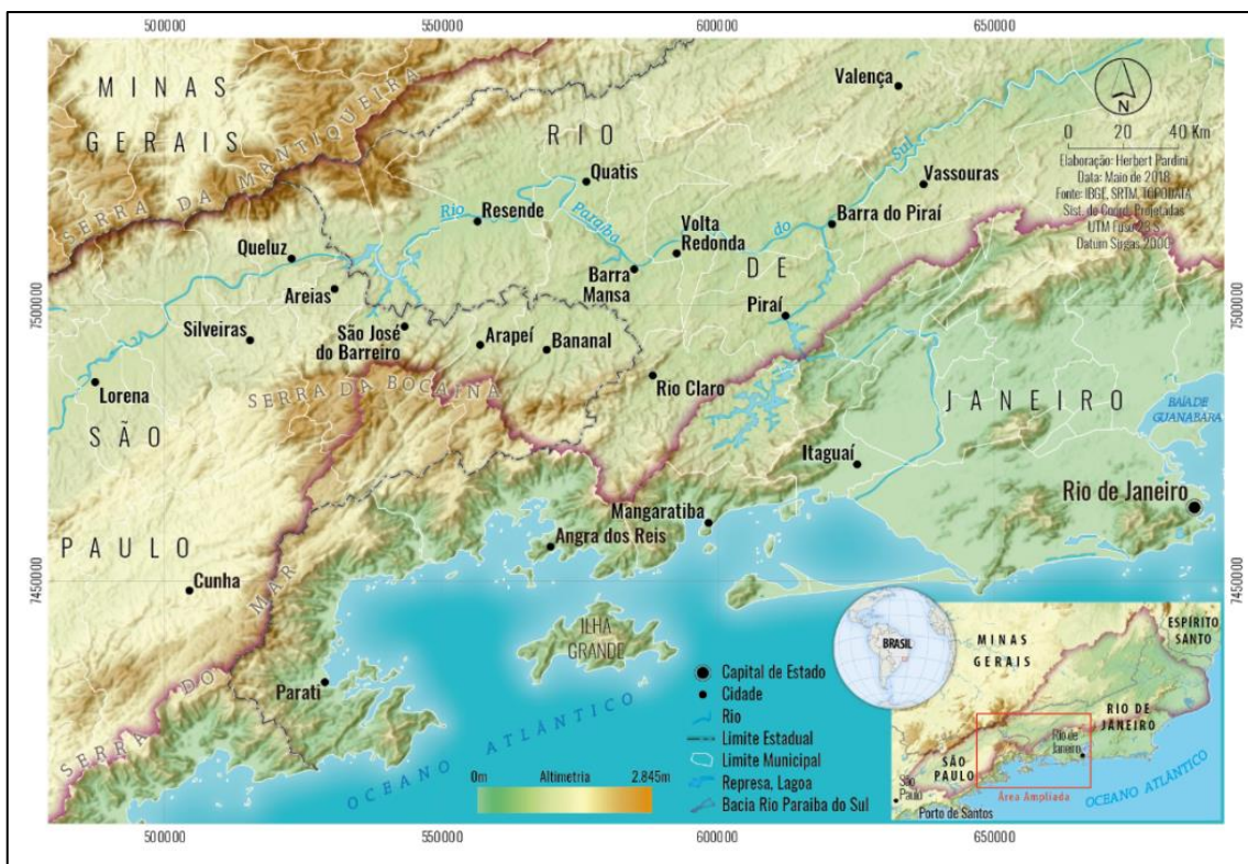
Figure 1. Paraíba do Sul River medium course covering the states of Rio de Janeiro, Espírito Santo and Minas Gerais.

The Paraíba do Sul Valley is a formation that crosses the border of the current states of São Paulo, Minas Gerais and Rio de Janeiro (Figure 1). The river strength produced numerous river terraces in its course, and its rushing waters and broad banks made many navigable stretches. By the bed of this watercourse, indigenous groups traveled, composing old ways, the 'peabirus', being the main route to the Puris, an indigenous group that lived by the shore, to seek refuge while the colonists advanced through the coast 8 . The indigenous peoples of the territory we now know as Brazil, contrary to the widely accepted assumption they did not alter the vegetation cover during the pre-European period, did change the Brazilian landscape 9,10,11 and their uses of nature are the first mark we have to bear in mind when thinking about the Paraíba do Sul Valley Historical Geography.